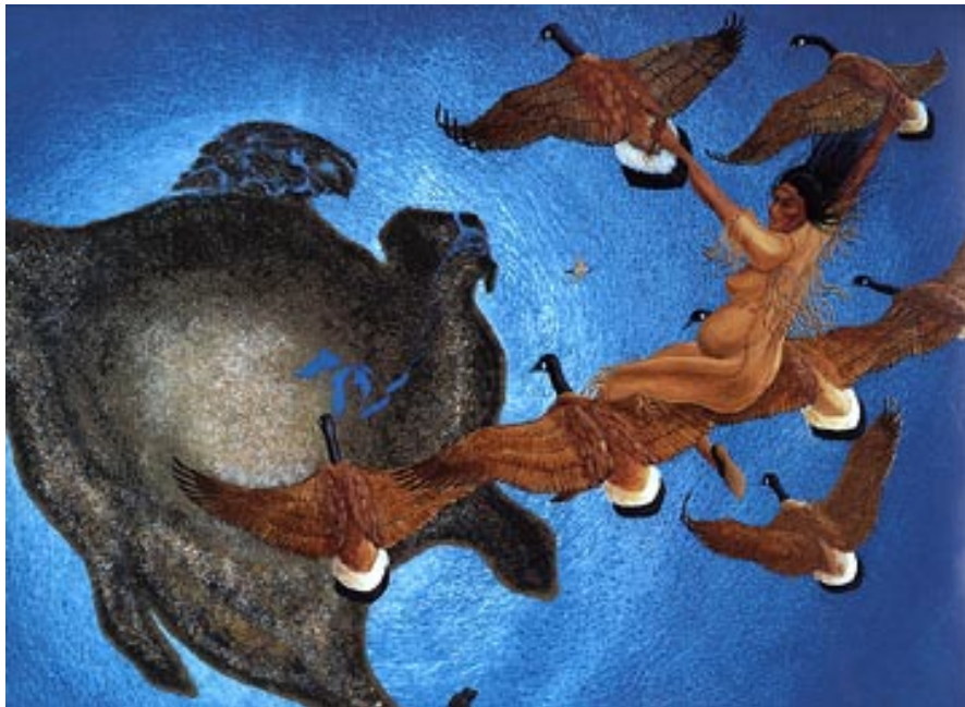
Skywoman Descending Great Turtle Island by Arnold Jacobs (Onondaga) Copyrighted 1981.

Read the following turtle creation myth (Onondaga version) to the participants.